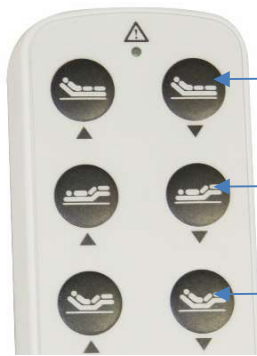
Controls Back Rest