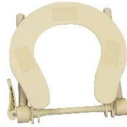
Face Cradle frame