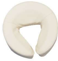
Face cradle cushion