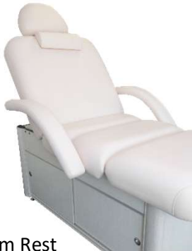
Arm Rest Prongs