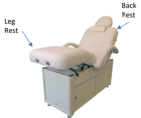
Controls Back and Leg Rest